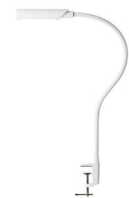
UBERLIGHT™ FLEX 3100TL INCLUDED