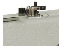
BUILT-IN BOBBIN WINDER