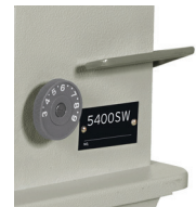
STITCH DIAL & REVERSE LEVER